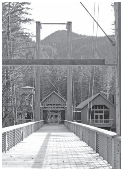
Looking across the suspension bridge toward the north doors. Note lookout tower on left.