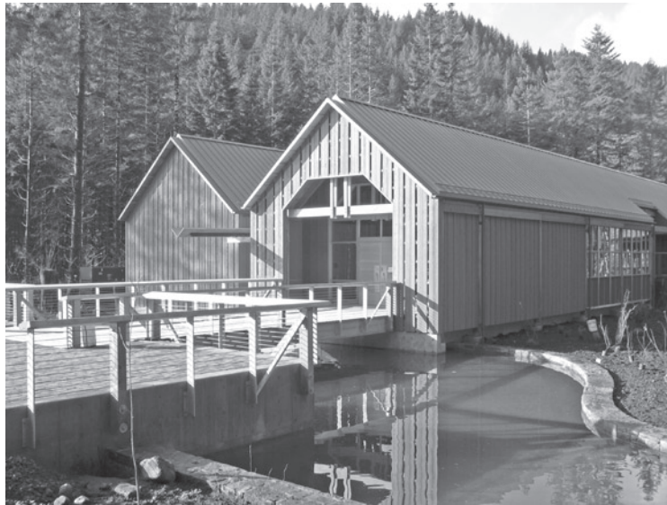
Center construction is nearly complete and exhibit installation begins soon. The view above shows the front entry and fire pond area.